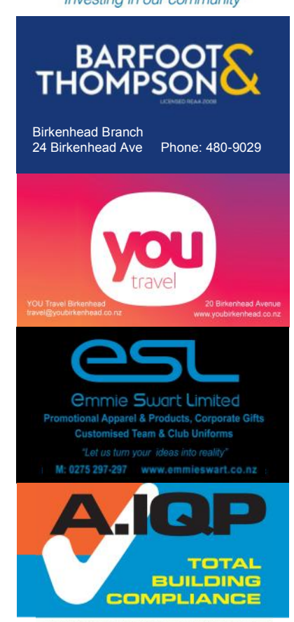
ASBESTOS MANAGEMENT PLANS